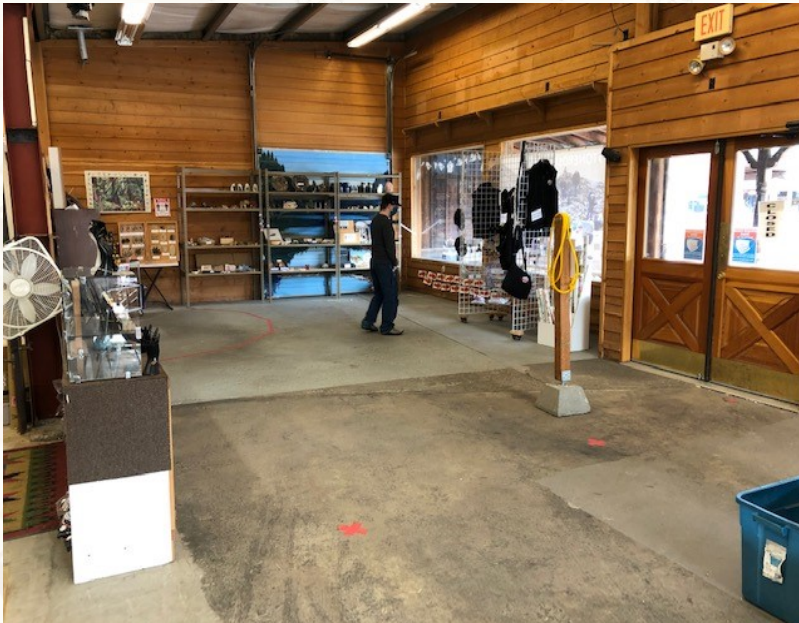
Partial view of the temporary retail and orientation area. More photos on page 3